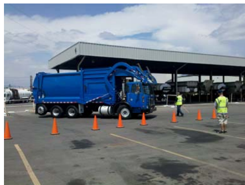
Alley Back-up Obstacle